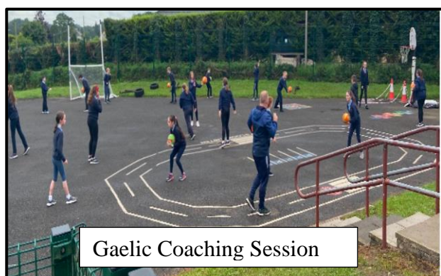
Gaelic Coaching Session