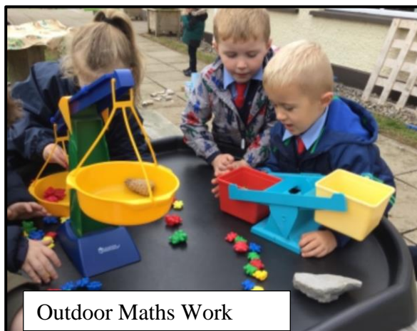
Outdoor Maths Work

Learning will be a source of pleasure; this can be achieved through work of a practical nature. Practical work includes Drama in Literacy, RE, PDMU etc; practical work and experiments in Numeracy, World Around Us and Activity Based Learning.