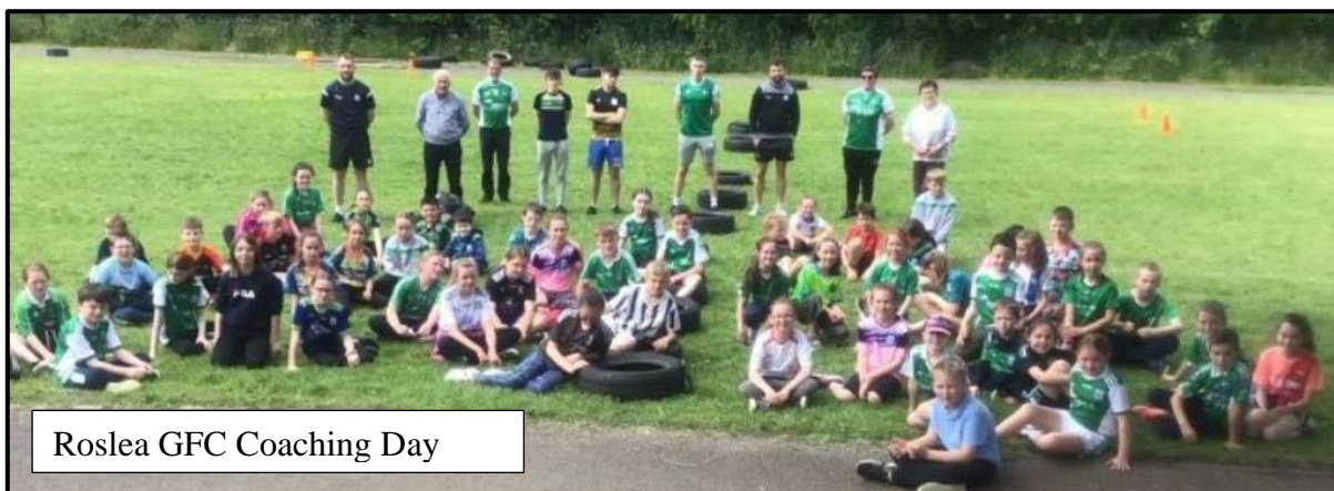
Roslea GFC Coaching Day

We see our school as a central part of the local community and we are proud of the strong links we have nurtured with local businesses, Roslea Shamrock's GFC, St.Tierney's Church, neighbouring primary and post primary schools and indeed the wider community. By working together to give our pupil's the best opportunities and experiences, we enable them to grow and develop life skills and find their place as valuable members of society.