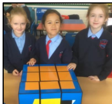
Active Learning in Key Stage 1