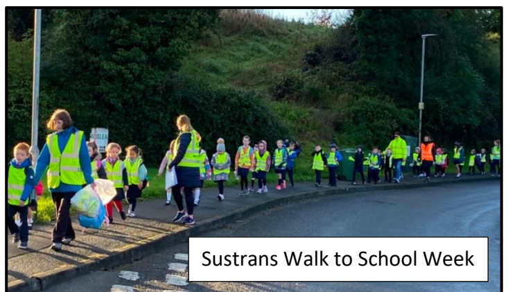
Sustrans Walk to School Week