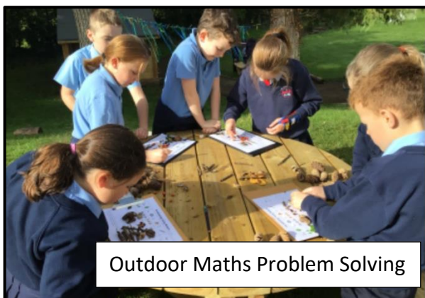
Outdoor Maths Problem Solving