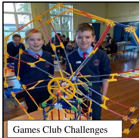
Games Club Challenges

This curriculum will seek to build on the range of learning experiences children will have experienced before they enter formal education in Primary 1. It aims to provide children with the skills and competencies they will need to succeed in school and future life. The curriculum seeks to prepare the pupils for the opportunities, responsibilities and experiences of adult life. Other aims of the school are to maximise the potential of each pupil, to develop self-confidence in the pupils and to promote a spirit of tolerance towards others.