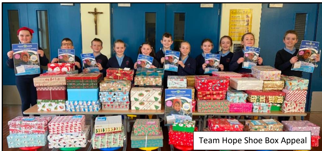
Team Hope Shoe Box Appeal

St. Tierney's Primary School has strong links with Roslea Cross Community Play Group and continues to develop a learning community with its neighbouring primary schools and post-primary schools and with the many groups and associations within the Roslea community and the surrounding areas. As a school community, we are committed to building relationships at all levels. This partnership consists of the Board of Governors, the staff, the pupils and parents all working together to ensure that our children receive the best education possible. The ethos of the school is experienced through the warm welcome given to all. All contributions are valued, whether from pupils, parents, staff, governors, external agencies or other stakeholders and we are committed to a process of self-evaluation to ensure we continue to improve on our previous best.