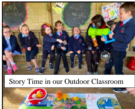
Story Time in our Outdoor Classroom

Pupils are offered a range of extra-curricular activities, either within the school day or after school. Participation in these activities is voluntary, though places may be limited. Activities on offer include; Gaelic football, camogie/hurling, tin whistle, fiddle, choir, art, games, athletics, sports, ICT, cycling proficiency, gardening and many more.