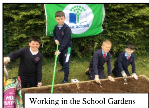
Working in the School Gardens