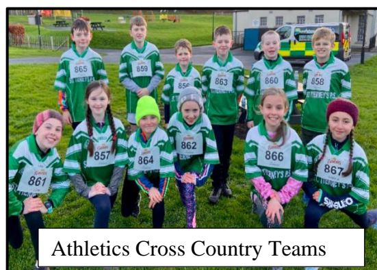
Athletics Cross Country Teams