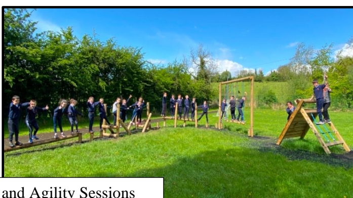
Trim Trail Fun and Agility Sessions