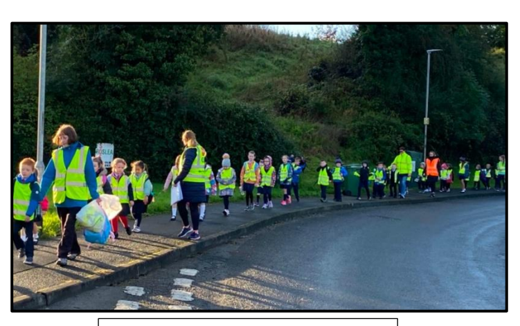
Sustrans Walk to School Week