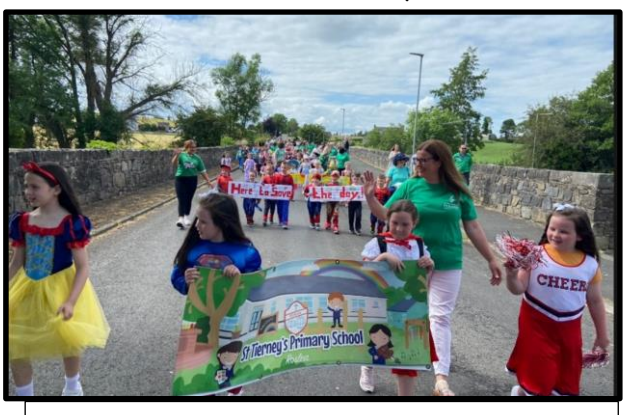
Leading the parade at Fermanagh Fleadh