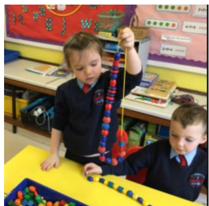
Active Learning in Numeracy