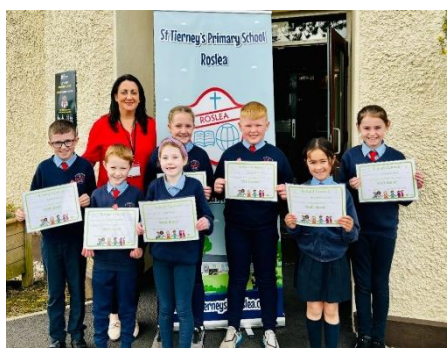
School Council for 23/24