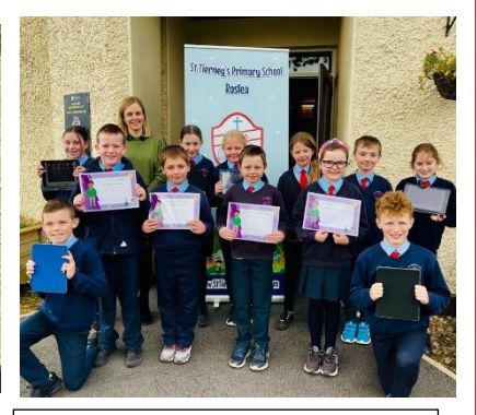
Digital Leaders for 23/24