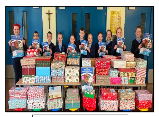
Team Hope Shoe Box Appeal

St. Tierney's Primary School has strong links with Roslea Cross Community Play Group and continues to develop a learning community with its neighbouring primary schools and post-primary schools and with the many groups and associations within the Roslea community and the surrounding areas. As a school community, we are committed to building relationships at all levels. This partnership consists of the Board of Governors, the staff, the pupils and parents all working together to ensure that our children receive the best education possible. The ethos of the school is experienced through the warm welcome given to all. All contributions are valued, whether from pupils, parents, staff, governors, external agencies or other stakeholders and we are committed to a process of self-evaluation to ensure we continue to improve on our previous best.