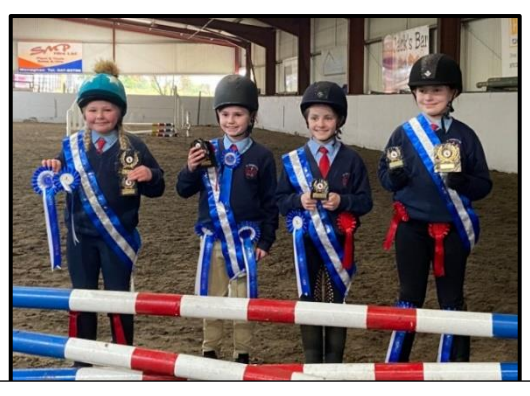
Mullaghmore Equestrian Schools League