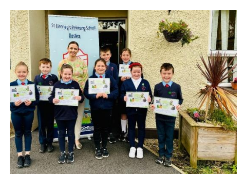
Eco Council for 23/24

BY promoting the Voice if the Child we are happy that in our school we are helping to build confidence and prepare young people for roles in society.