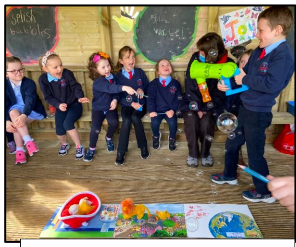
Story Time in our Outdoor Classroom

Pupils are offered a range of extra-curricular activities, either within the school day or after school through our popular Extended Schools Clubs. Activities on offer include; Gaelic football, camogie/hurling, tin whistle, fiddle, choir, art, games, drama, cooking, athletics, sports, ICT, cycling proficiency, gardening and much more.